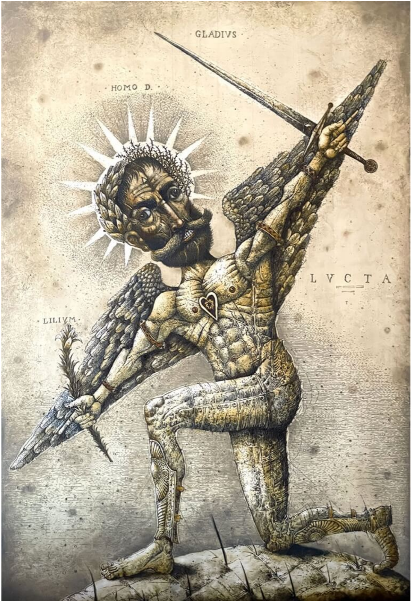
GESSOGRAPHY — A NEW KIND OF FINE ART